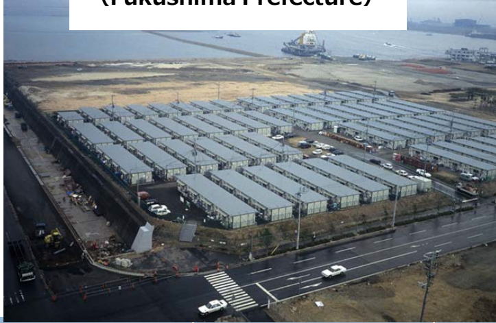
Temporary housings built after the Great East Japan Earthquake (Fukushima Prefecture)