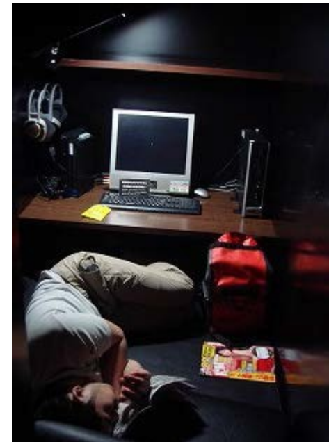
24-hour Internet cafés

Source: Ministry of Health, Labor and Welfare