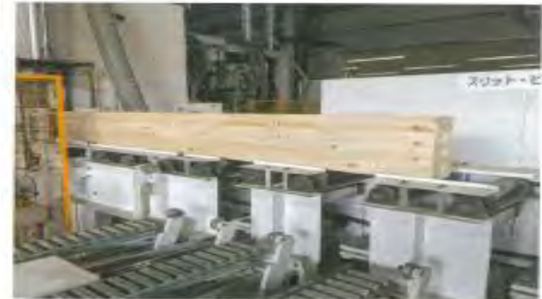
Processing in a Pre-cut factory