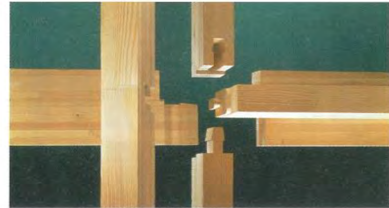
Typical Pre-cut housing construction members